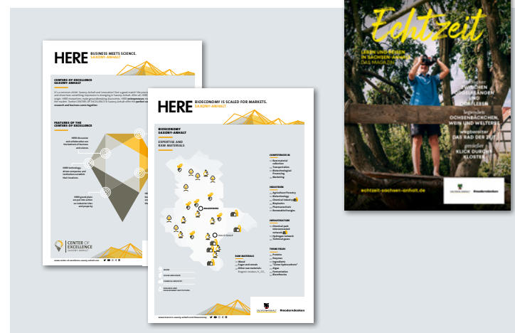
Fact sheet on Centres of Excellence and the Bioeconomy

When it comes to marketing Saxony-Anhalt as a travel destination, IMG is a centre of excellence for market and trend research. The key factors in this respect are strategic positioning and developing the market at home and abroad. Here #moderndenken involves creating cross-media marketing strategies . IMG also develops offerings in the digital field that help its partners to create their own digital marketing materials. SAiNT is a georeferenced database created by IMG that all its partners in the region can access. In addition, IMG develops and launches its own campaigns, such as “Truly stunning. Saxony-Anhalt” , which act as an umbrella for marketing tourism destinations and events.